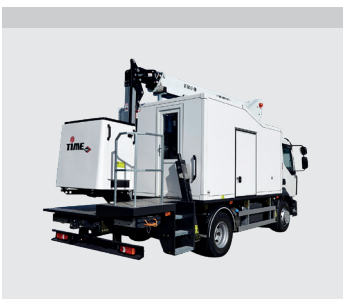
Workshop module for the chassis (optional)