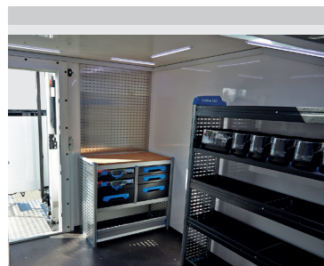
Workshop interior (optional)