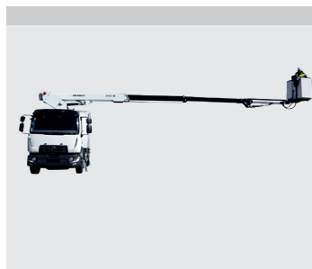
Turret/knuckle tail swing and outriggers within the mirrors