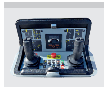
FPC (Full Proportional CANbus controls): Up to 4 simultaneous actions (2 per joystick)